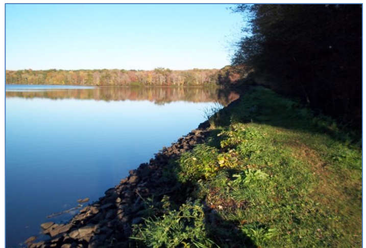
The Warren Reservoir, the headwaters to the Kickemuit River, in Swansea, MA