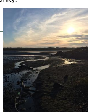
Ogunquit River bacteria monitoring station OR-2

Ogunquit, ME- FBE is working with the Town of Ogunquit, ME on a 319 Phase I initiative to reduce bacteria levels in the Ogunquit River, a state-listed impaired waterbody that has experienced persistent bacterial contamination from unidentified sources. The high bacteria counts and subsequent public beach closures is attributed to nonpoint source (NPS) pollution. The goal of this project is to identify and treat potential sources of bacteria contributing to surface water contamination throughout the watershed. The Town has been proactive in maintaining a bacteria monitoring program at more than ten sites throughout the watershed, and as a result, multiple "hotspots" with high bacteria levels have been identified. With support from the Steering Committee over the next two years, this project will implement several Best Management Practices (BMPs) for stormwater mitigation within the watershed, evaluate potential areas of illicit discharge from septic and sewer systems, and administer a strong public outreach campaign to enhance local awareness of NPS pollution in stormwater.