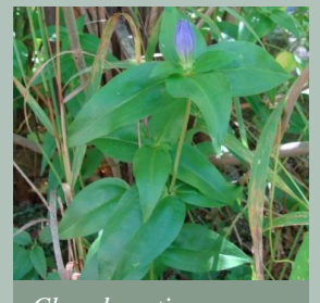
Closed gentian (Gentiana clausa) documented along Otter Brook in Sullivan, NH. This species' flowers do not open, and are only pollinated by insects strong enough to force their way in.